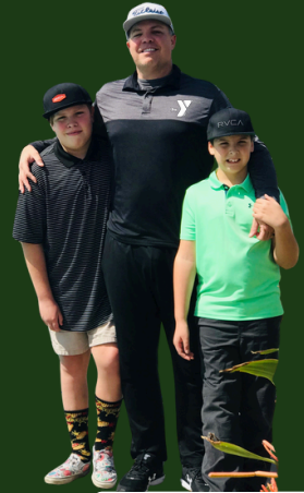
Laguna Niguel Cadillac GMC

The evening reception will feature complimentary wine, appetizers, and entertainment.